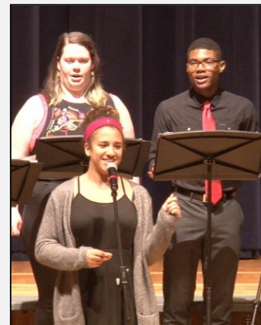
Spring Vocal Music Concert