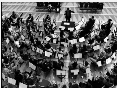
Concert Band in Washington DC