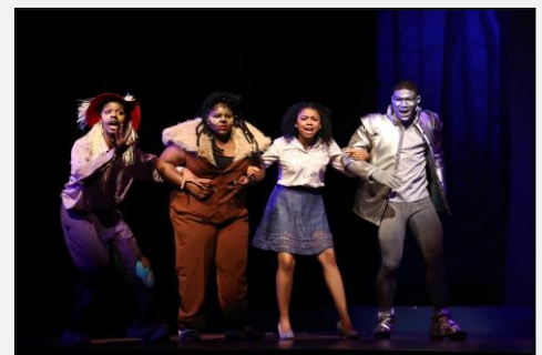
"The Wiz" - Spring Musical