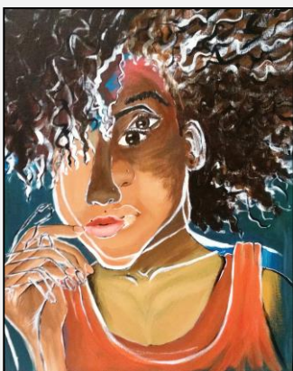
Self-Portrait New AP Studio: Drawing and Painting course