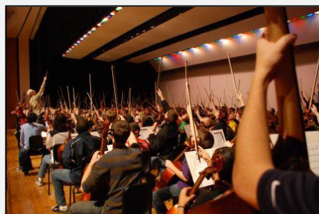
ETHS & District 65 Orchestra's