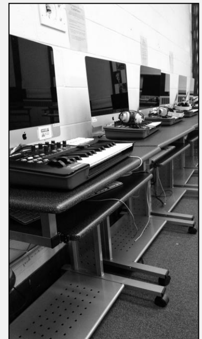
New Music Technology Lab