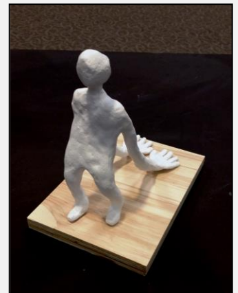
Figure Sculpture New 2 Sculpture course