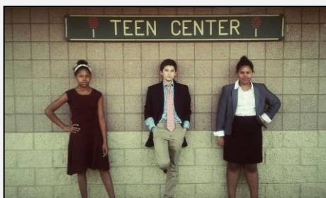
Speech & Debate Team