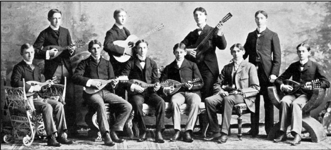
ETHS Mandolin Club, 1897