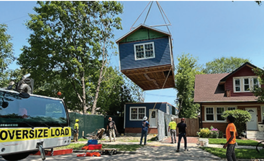
Both floors of the eighth house were moved from the Evanston campus this summer to Brown Ave. and hoisted into place by a giant crane. The interior of the house was to be completed later this year, and the affordable home should be ready for a family to move in next year.