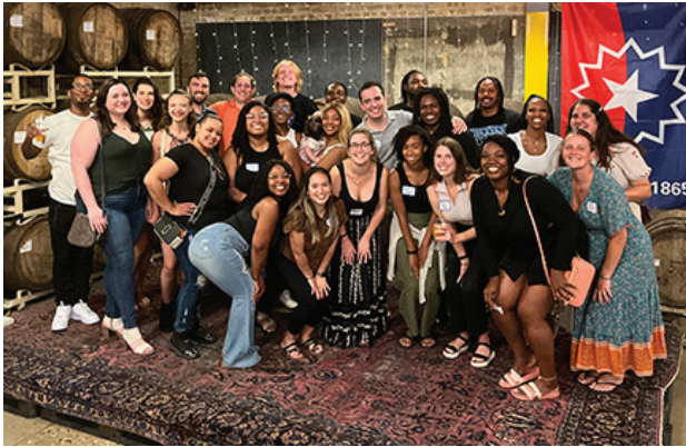
The Class of 2013 celebrated twice this year. One reunion attracted about 30 people (see photo at left) in August. And a September three-day gathering drew around 65 classmates (see below).

And then there was a weekend-long reunion, September 1-3, that 65 people attended. On Friday, they attended a Meet & Greet at Chasers Sports Bar in Niles. Saturday found them on a boat cruise, the Anita Dee II, out of DuSable Harbor. And Sunday's wrap-up event was a Family Day BBQ at Lovelace Park in Evanston.