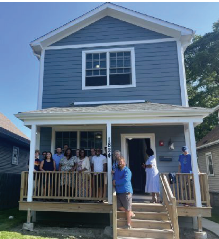
This summer the school hosted an unveiling and open house on Emerson Street in the Fifth Ward for the program’s seventh completed home. Students built this particular home during the 2019-2020 year. It has three bedrooms and two bathrooms, along with a front and back porch.