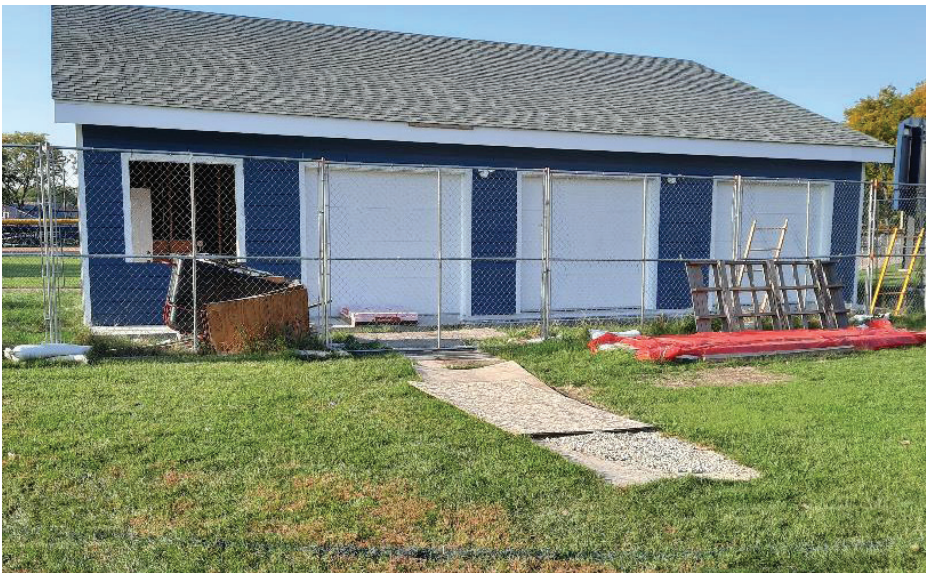
Located at the east end of the back sports playfields just off Church St., the new athletic storage unit, approximately 20 ft. by 50 ft., includes three garage bays, a second-floor storage area, and a concession stand for snacks during the games. In addition, this facility will incorporate green technology with a solar-powered addition. The first floor has 9 ft. walls and the second floor has 8 ft. walls.