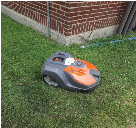
Part of the energy-friendly landscaping services are 29 robotic lawnmowers that whirl around the 65-acre campus. Like an indoor Roomba, each robot mows a declared area outside and when done, returns to its charging base. They are satellite-driven and can be programmed to cover any area that needs mowing. The students, of course, are fond of the robots, have given them names, and, on occasion, decorated them with googly eyes.

Other current and upcoming initiatives include applying through ComEd for a public school carbon-free assessment; seeking American Green Zone Alliance certification for landscaping services that are now 100% electric, battery, or robotic; planting 20+ native trees and plants on campus that are pollinator friendly; and expanding composting to all five cafeterias, among other plans.