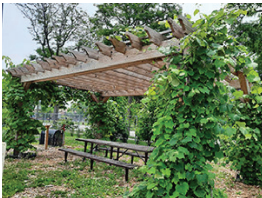
This grape arbor, built by the students in the Geometry in Construction class, is located near the football stadium, adjacent to the Edible Orchard. Local Boy Scout Troop 815 planted Concord grapes in June 2021 as part of an Eagle Scout project. They will provide coverage of the picnic tables and grapes to harvest for jams, jellies, juice, and eating off the vine.

The gardens serve as a classroom for students taking the Urban Agriculture course. During the school year, Ryan works once a week with each of the